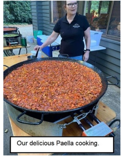
Our delicious Paella cooking.